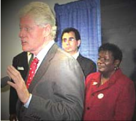
ACORN national president Maude Hurd (atright) with former President Bill Clinton in 2006. Clinton was at a press event urging Hurricane Katrina survivors to claim the Earned Income Tax Credit (EITC).

(2002), $1,977,306 (2001),$1,296,085 (2000),$1,151,929 (1999), $1,124,989 (1998),and $1,365,349 (1997).