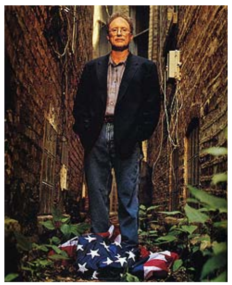
ACORN supporter and unrepentant terrorist William Ayers stands on the U.S. flag in this 2001 photo.

Ironically, ACORN and its affiliates, all reliable cheerleaders for higher taxes, are longtime tax deadbeats. A search of public records found more than 200 federal, state, and local tax liens adding up to more than $3.7 million that are associated with groups